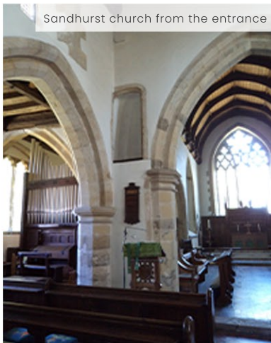
Sandhurst church from the entrance