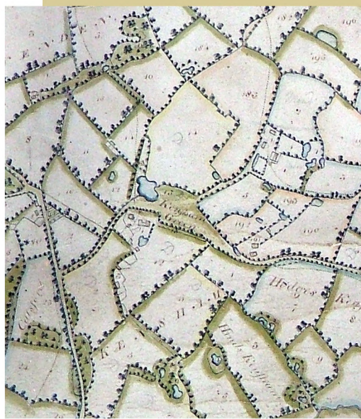
Kensham Green, Rolvenden, with connecting lanes from a parish estate map c. 1829