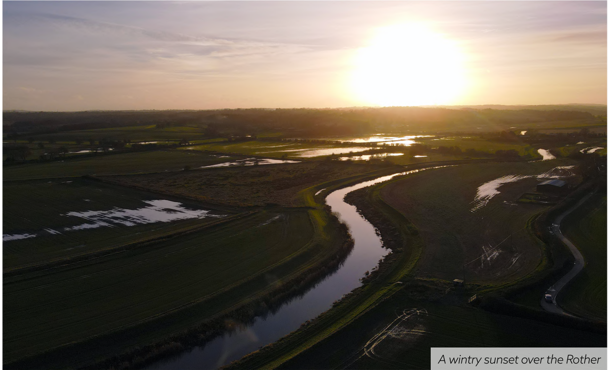
A wintry sunset over the Rother

Welcome to Issue 13 of the Lossenham Project newsletter, keeping you up to date with the latest news and any events you can get involved in.