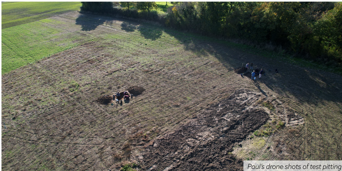
Paul's drone shots of test pitting