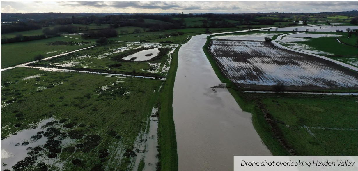
Drone shot overlooking Hexden Valley

Welcome to Issue 12 of the Lossenham Project newsletter, keeping you up to date with the latest news and any events you can get involved in.