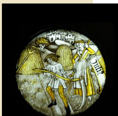
15th-century hay-making, depicted in an English stained glass window.